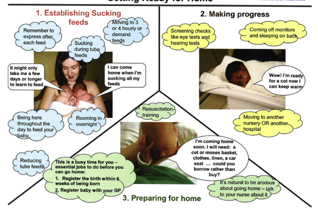
Fig. 3. Getting ready for home poster.