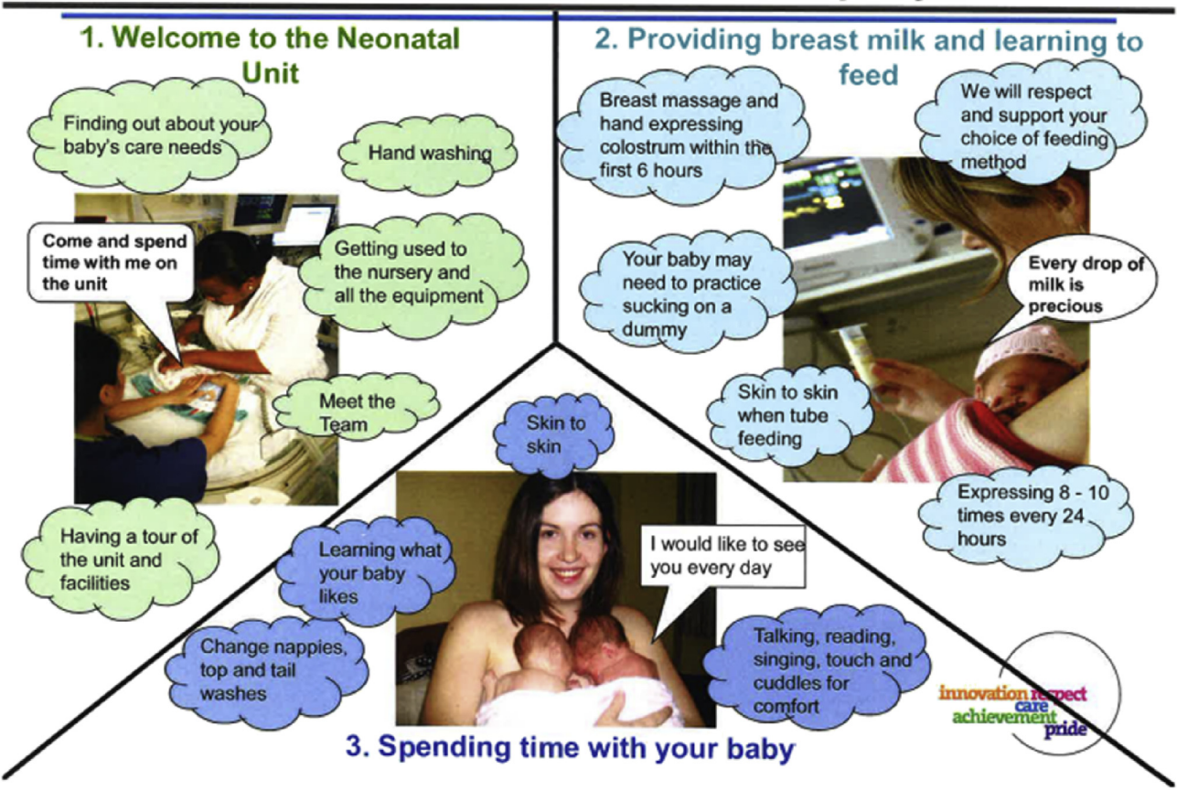
Fig. 2. Welcome to the unit - Early days poster.

are introduced to the discharge co-ordinator who will support the family preparing for home and follow them up once at home. They make sure the discharge planning checklist is being completed including; basic life support training, safe sleep advice, screening and immunisations are up to date, baby and family are registered with local healthcare providers, that parents have everything ready at home and act as liaison between parent and their health visitor and GP so they are prepared for home with any prescriptions and follow up appointments in place.